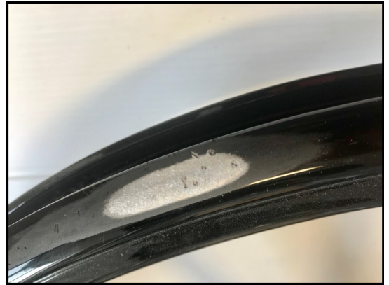
Step 2 - rub down surface to a smooth finish