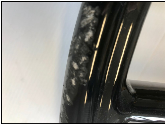
Step 1 - assess damage