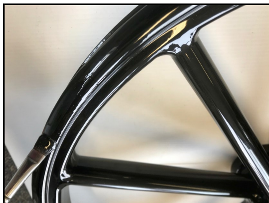
Step 5 - if necessary rub down and apply second coat.