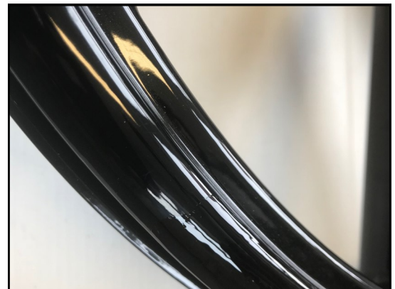
Step 6 - allow to dry, add polish to protect paint

Touch up paint available from Bennington Bennington Carriages - 01400 281280 www.benningtoncarriages.co.uk