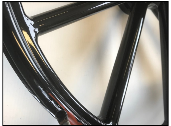
Step 4 - apply top coat